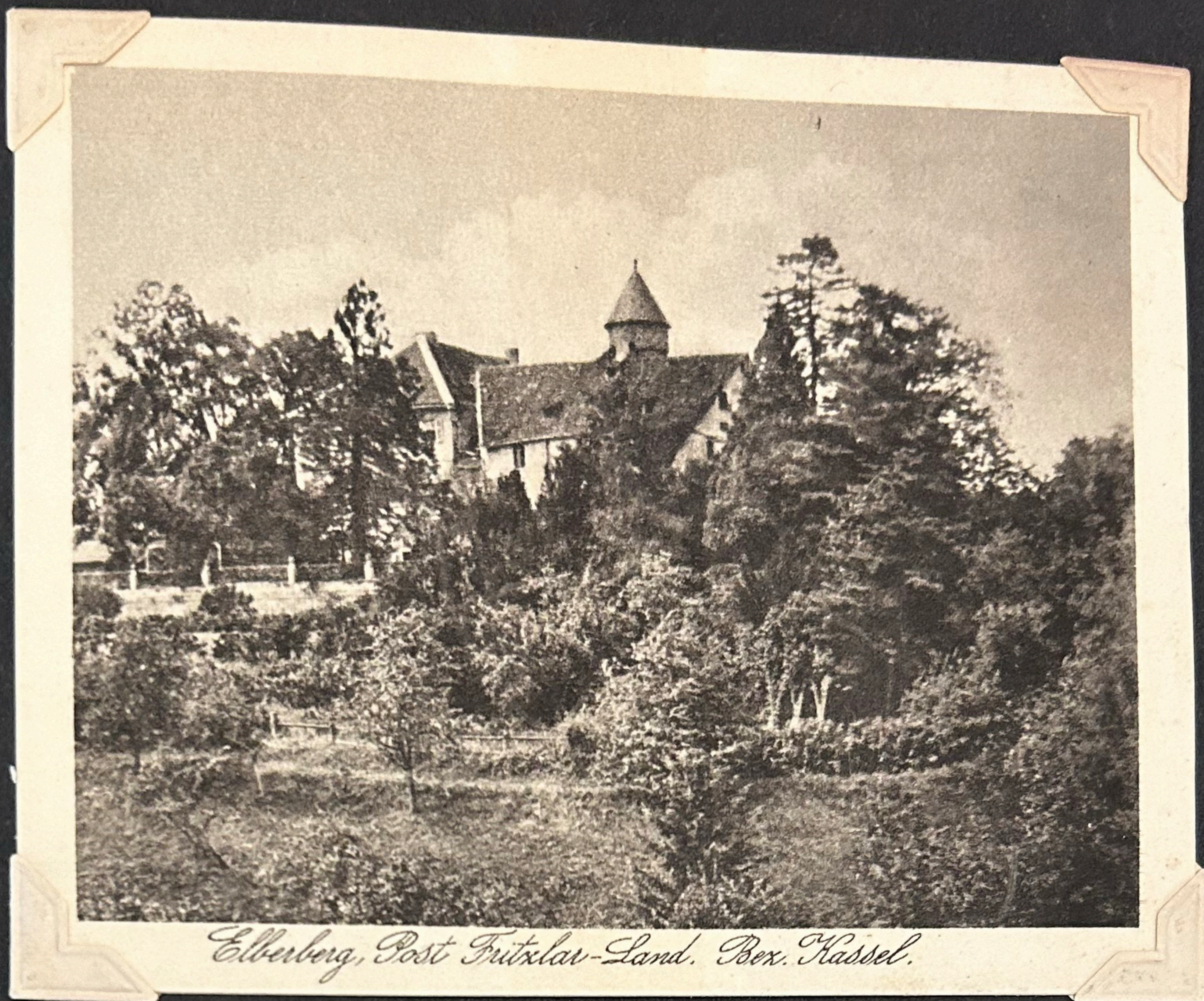
Elberberg, Post Fritzelar-Land, Box. Kassel.